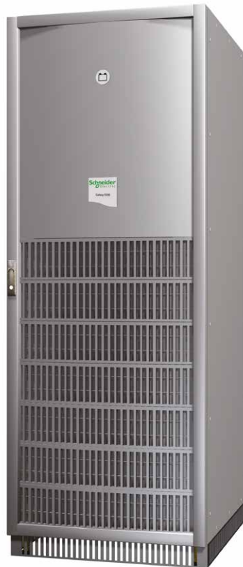
Galaxy 5500 Battery Cabinet